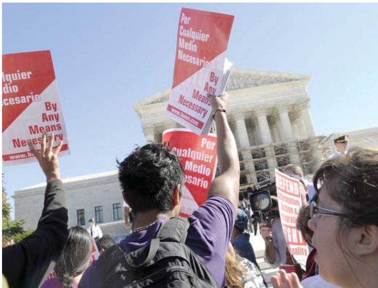
Protesters in support of affirmative action gather outside the Supreme Court on Oct. 15.