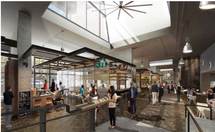
Rendering courtesy of SkB Architects and Studio 216