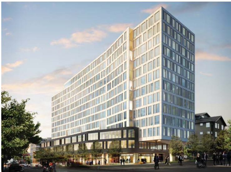
Rendering courtesy of SkB Architects and Studio 216